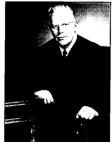
Chief Justice Earl Warren wrote the opinion for Miranda's case.

The Court also said police must inform suspects of the right to have a lawyer present during the questioning. Technically, the right to a lawyer is a 6th Amendment right. But the Court said that a lawyer is absolutely necessary to protect a suspect's 5th Amendment right not to testify against himself or herself. That's because a lawyer can advise a suspect about what to say and what not to say during the questioning. Because Miranda's 5th Amendment right was violated, the Court reversed his conviction.